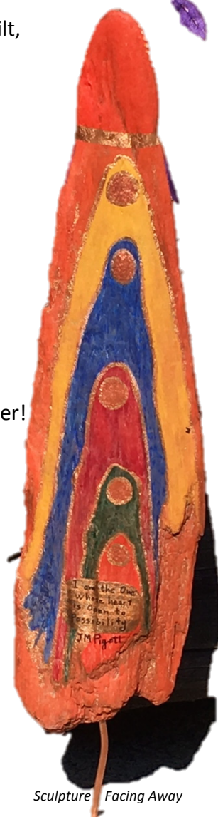
Sculpture Facing Away