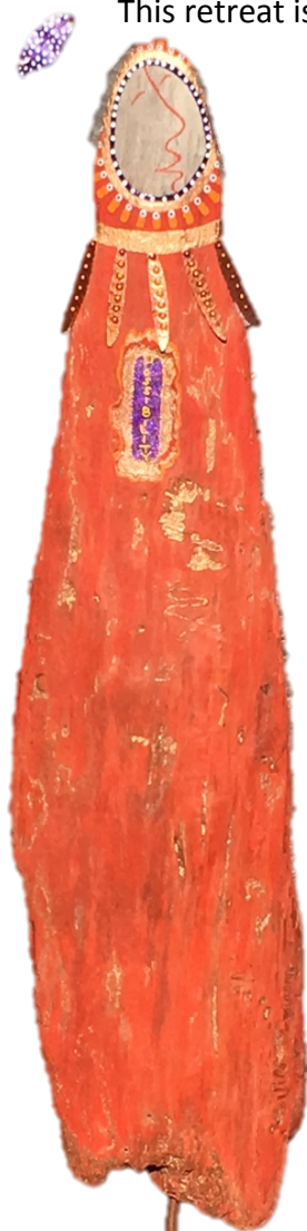
Sculpture Facing Front